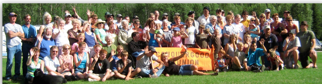
This photo is from the 2008 Conquergood Reunion in Montana.

take a walk and enjoy the beautiful country side. Try not to get lost in the maze and miss the big Cowboy Supper. Saturday night we will have a big party in the saloon with dancing and more sharing of stories. Sunday we will have breakfast and then the traditional Conquergood Auction to raise funds for the next reunion in 2012. Please donate an item for the auction. Then we will have a family meeting and choose the location and host family for the next reunion. See the website for more details and photos.